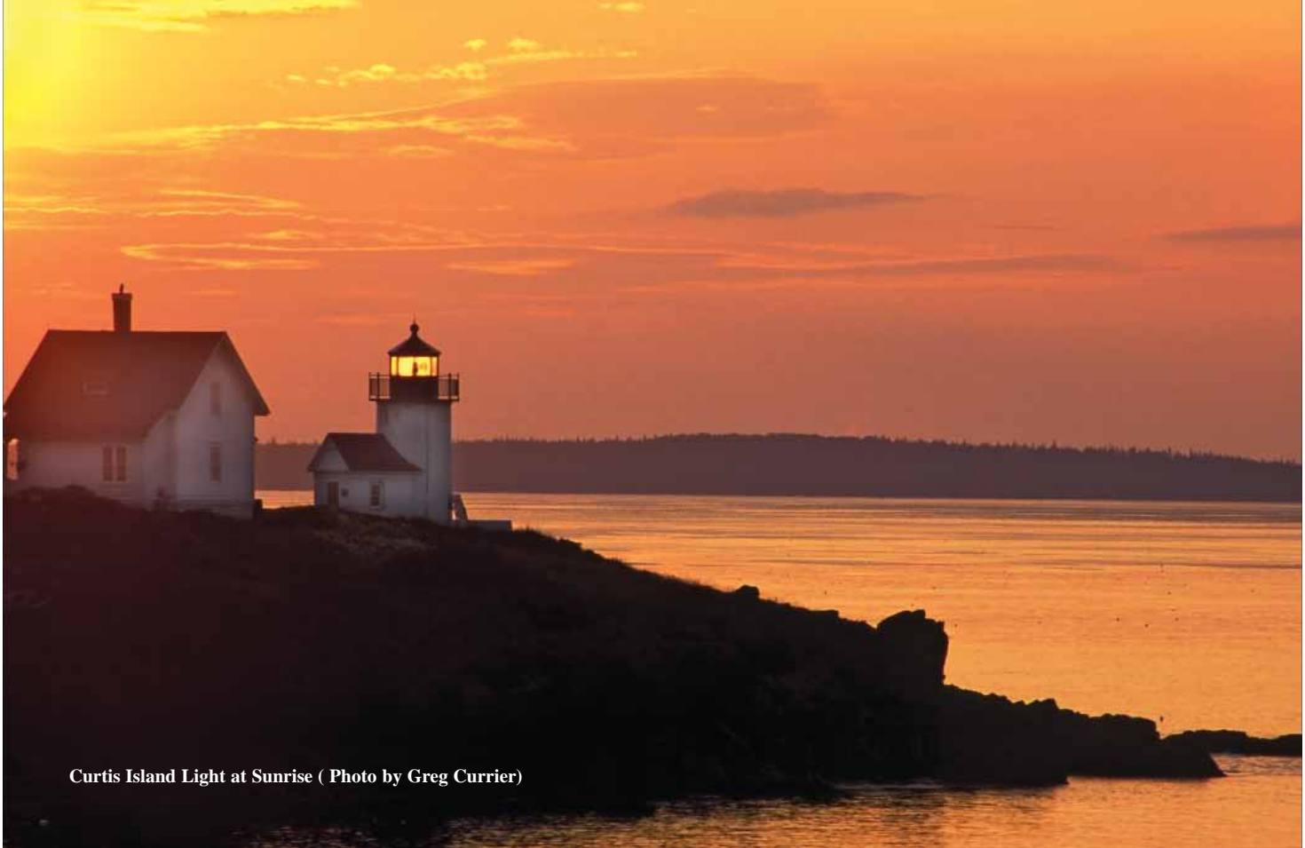
Curtis Island Light at Sunrise