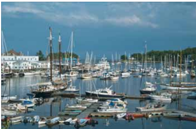
Camden Harbor

Camden Yacht Club's junior sailing program take to wind farther out. Still, not all is play in this harbor as The Wayfarer, a working boatyard, and some lobster fishermen also call it home. Curtis Island and its lighthouse punctuate the view at the harbor's entrance as its rocky waterline stretches out onto Penobscot Bay, bobbing with colorful lobster trap buoys.